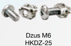
Dzus M6 HKDZ-25