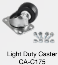
Light Duty Caster CA-C175