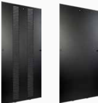
Louvered Side Panel