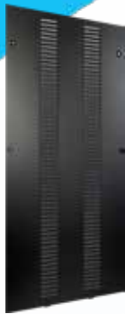
Louvered Side Panel