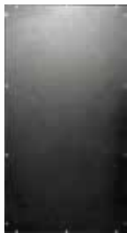
Solid w/o Cable Egress Ports