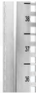
MX Mounting Channels