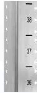
MX Mounting Channels - Tapped