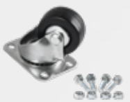
Light Duty Caster CA-C175