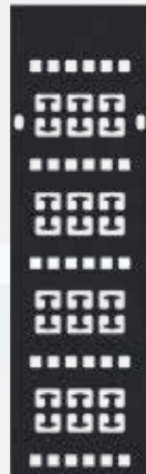
Cable Lacing Strip