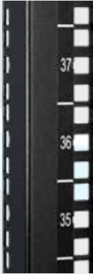
MX Mounting Channels