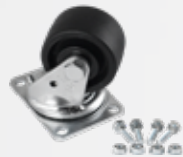
Heavy Duty Caster CA-C1200