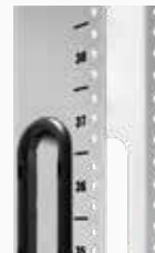
MCW Profile Reducer