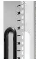
MCW Profile Reducer