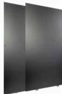
Side Panel Cable Management Side Panel with Levelers