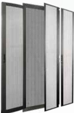
Curved-Face Vented-Flush French-Flush

AMCO Enclosures offers standard color choices (up to 2 per console) for no extra charge. Custom colors are available and quoted upon request.